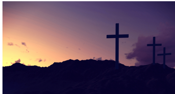
Christ took the punishment for us.

The apostle Paul wrote this to Galatian churches who were struggling with the notion that they did not have to obey the Old Testament Law of Moses any more due to being under the New Testament Law of Christ. Today’s verse is just one of many points Paul is making towards that end, namely, that the Law of Moses was taken out of the way and replaced with the New Covenant when Christ died on the cross ( Eph. 2:14-16 ; Col. 2:13-17 ; Heb. 9:15-17 ).